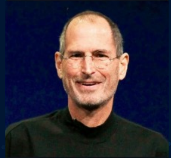
Steve Jobs co-founder of Apple, Inc.

“Technology is nothing. What’s important is that you have a faith in people, that they’re basically good and smart, and if you give them tools, they’ll do wonderful things with them”