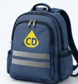
Civil Defence grab bag