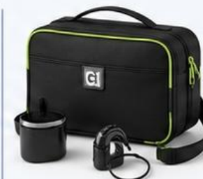
Cochlear implant grab bag